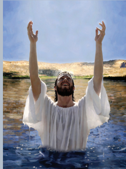
Jesus, though sinless, was baptized to set us an example.

“Then Jesus came from Galilee to John at the Jordan to be baptized by him. And John tried to prevent Him, saying, ‘I need to be baptized by You, and are You coming to me?’ But Jesus answered and said to him, ‘Permit it to be so now, for thus it is fitting for us to fulfill all righteousness.’ Then he allowed Him. When He had been baptized, Jesus came up immediately from the water.” (Matthew 3:13-16) Jesus, though sinless, was baptized to set us an example.