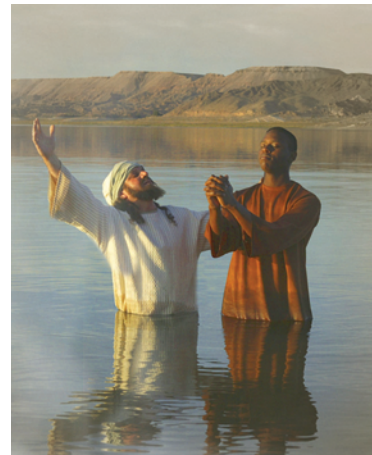
Biblical baptism is by total immersion in water.

There is an interesting story of Philip who preached to a “eunuch” concerning the death of Jesus the Messiah. The man came under conviction. What happened next? “Now as they went down the road, they came to some water. And the eunuch said, ‘See, here is water. What hinders me from being baptized?’ Then Philip said, ‘If you believe with all your heart, you may.’ And he answered and said, ‘I believe that Jesus Christ is the Son of God.’ So he commanded the chariot to stand still. And both Philip and the eunuch went down into the water, and he baptized him.” (Acts 8:36-38) Baptism always follows our profession of faith in Jesus. In fact Jesus Himself said that “he who believes and is baptized will be saved.” (Mark 16:16)