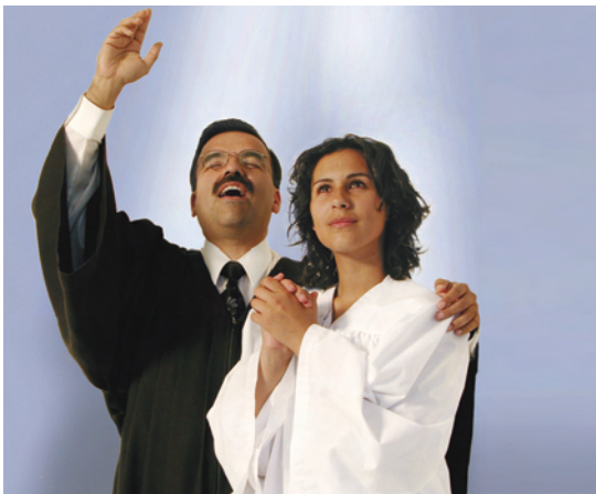
Those who accept Christ are baptized in His name.

To Jesus, baptism was very important. He told His followers to go and make disciples of all nations and to baptize them. (Matthew 28:18-20). Peter's sermon at Pentecost ended with this appeal: “Repent and let every one of you be baptized in the name of Jesus Christ.” (Acts. 2:38) Later it states that “those who gladly received his word were baptized...” (Acts. 2:41). Those who accept Christ as Lord are instructed and expected to be baptized in His name.